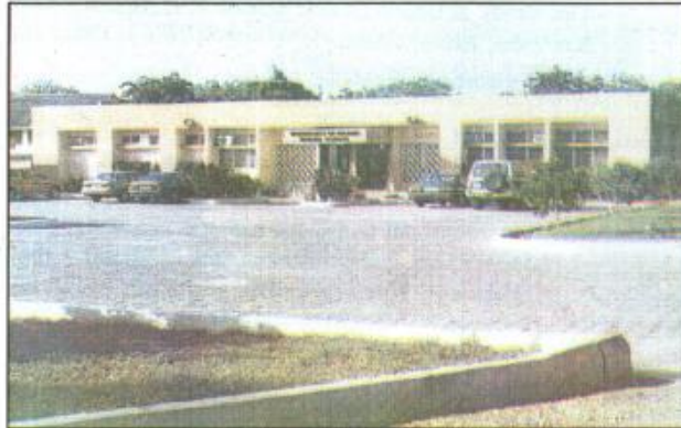
Front view of the new Dental School building

The Dental School is one of the six institutions constituting the College of Health Sciences of the University of Ghana. The School is housed in an ultra modern building in 23 rd August, 1999 (Picture below). Since the localization of the clinical training in Ghana, the Dental School has graduated four batches of graduands, totaling 18 dental surgeons.